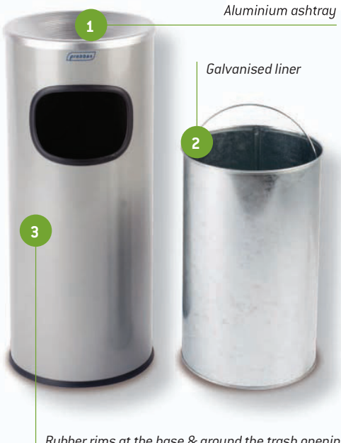
Rubber rims at the base & around the trash opening protect the floor and prevent accidental injury